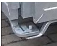
User-friendly opening system for fast and easy folding / unfolding